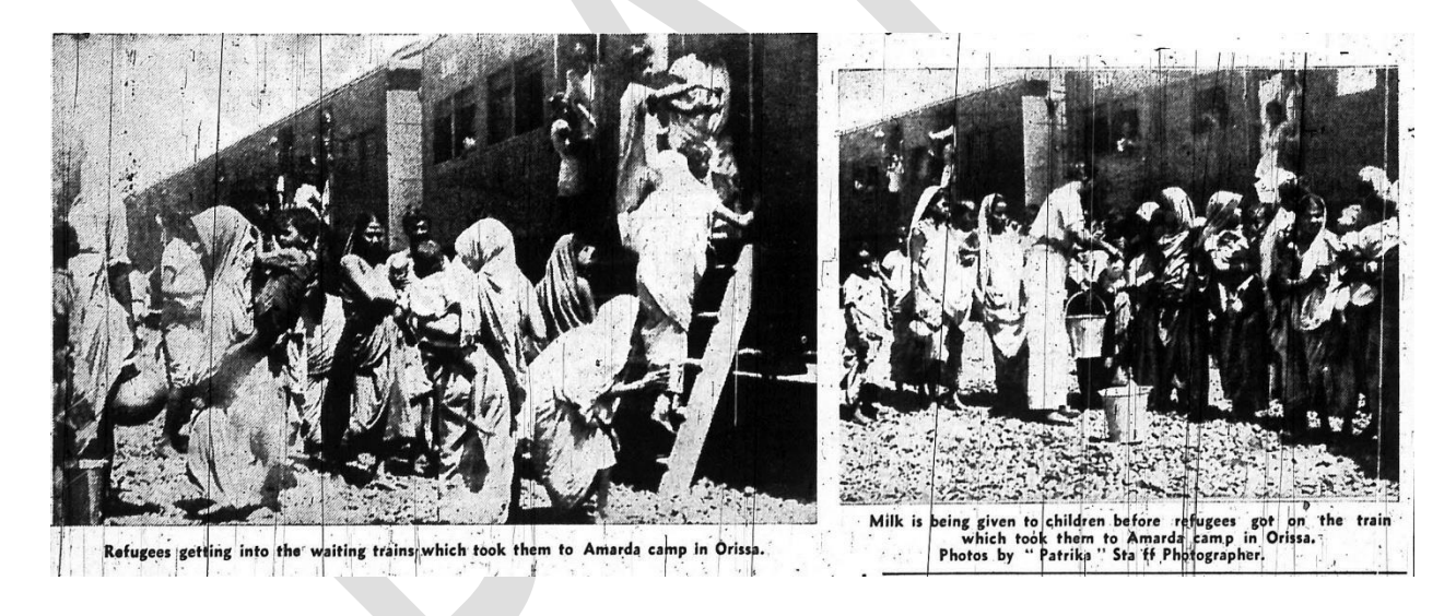
Refugees being taken to Amarda Camp from Shalimar, Amritabazar, April 9, 1950.

From the Sealdah Station too, the government tried to get hold of the refugees and to take them to different camps outside the city and the province. B.G. Rao, Joint Secretary of the Ministry of Rehabilitation, Government of India, in a press interview on July 14, 1950, informed; "dispersal of