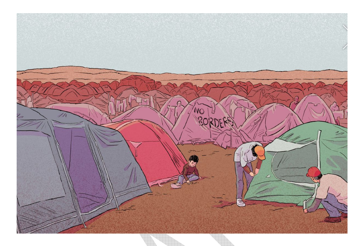
Fig. 3. The concentration camps for displaced refugees of the Syrian War. Bury Me My Love , 2017.