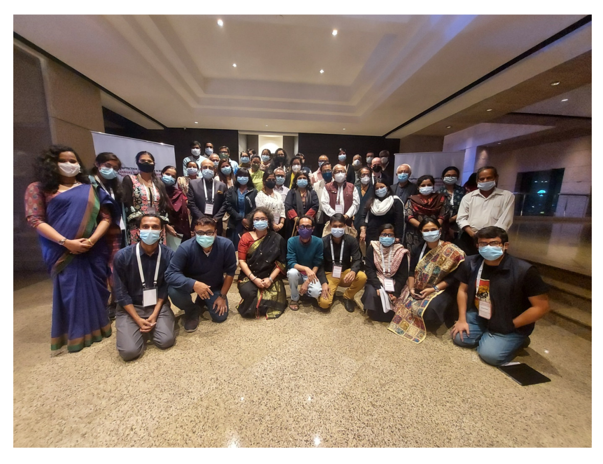
Group Photo with Workshop and Conference Participants 2021