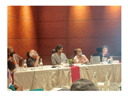
Parallel Session II on Climate Change, Ecology and Displacement