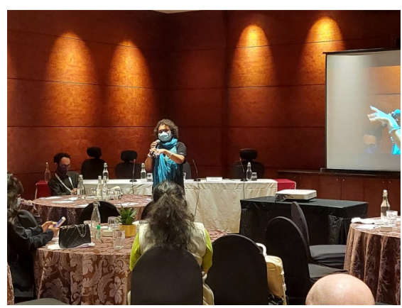
Panel Discussion on Climate Change