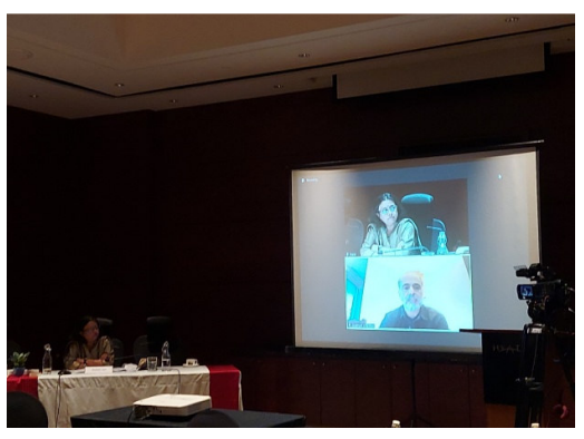
Module B Special Lecture by Shahram Khosravi