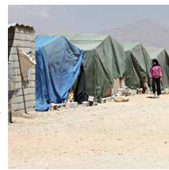
Tents in the grounds of a mosque provide shelter for Syrian refugee families in Lebanon.

There are very few opportunities for employment, so many refugees resort to desperate measures to cover their costs. These include prostitution, early marriage, begging and working for exploitative wages. The World Food Programme is implementing a large-scale food voucher programme and other organisations are providing household items and cash support. Some agencies manage work creation and training schemes. However, even before the crisis, employment in the refugee-hosting areas was hard to