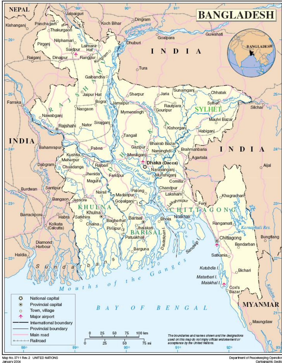
(United Nations Cartographic Section: Map no. 3711 ref.2, dated January 2004; edited by COI Service to show Sylhet and Rangpur Divisions.) 12

1.08 The map below shows the main cities and towns, and the seven divisions, of Bangladesh.