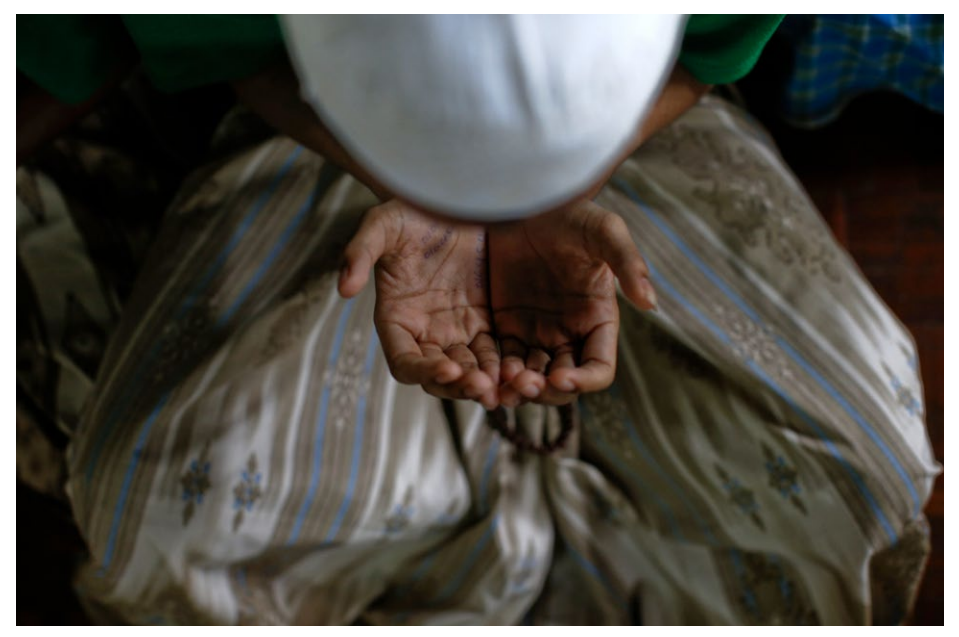
DELIVERANCE: A Rohingya man prays during the Muslim fasting month of Ramadan at an immigration camp in southern Thailand. Most of the Rohingya from Myanmar are trying to find asylum in neighboring Malaysia.