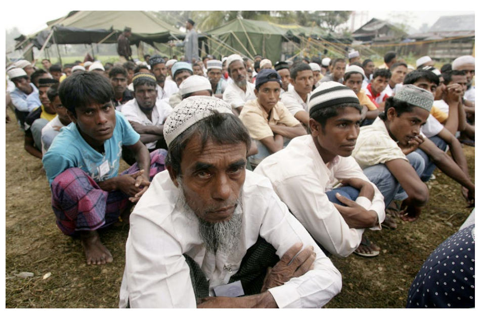
WASHED UP: Ethnic Rohingya refugees from Myanmar being transported to a temporary shelter in Indonesia's Aceh province in April 8.