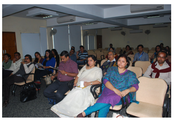
Special Programme at MAKAIAS