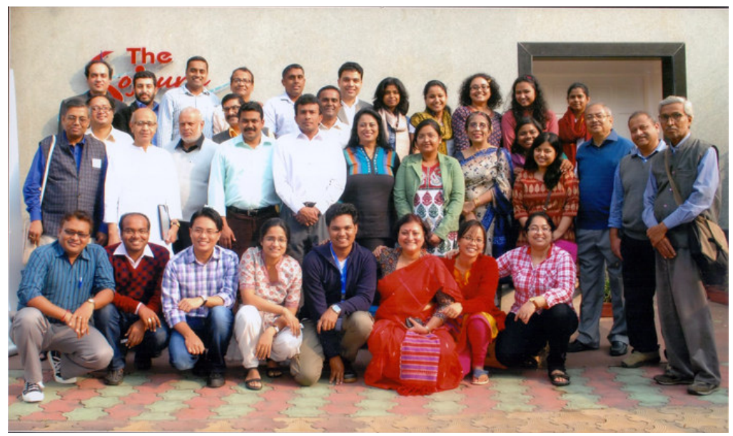
Participants of the Eleventh Annual Orientation Course with few CRG Members

Detailed reports on all the features of the programme in 2013 will be on our website by March 2014.